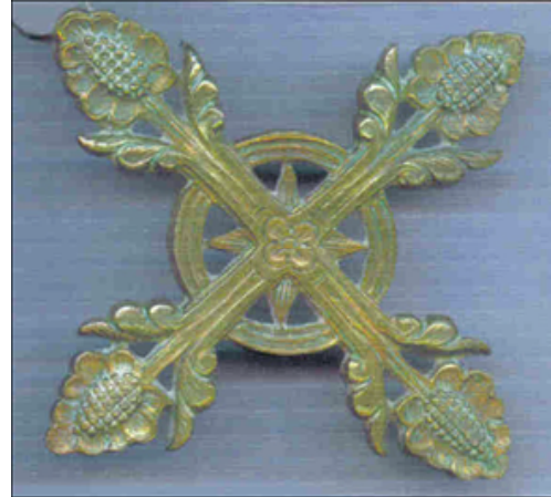
Figure 2 From The Montstrance

The two photographs of the bronze decorations (above, from the monstrance) are beautiful and fascinating too. The most surprising thing is this. That what we see in the photographs agrees with the picture of the meeting between the white and Indian people 500 years ago. And what we see in the one photograph are the four directions indicated by shafts of wheat pointing to the sharing of food by all people everywhere. Different countries will work together and feed each other because finally we agree to work together everywhere and to share what we have. And this shocked me.