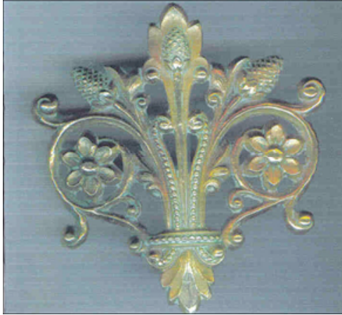
Figure 1 From The Montstrance

I listened to the Spirit and was shocked at the things I learned. Now the first thing I learned was that even though people see the picture, they don't know exactly what it means today. The two are making an agreement to work together and to share what they have.